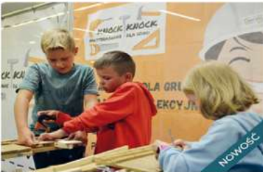
KNOCK KNOCK: MAJSTERKOWANIE DLA DZIECI