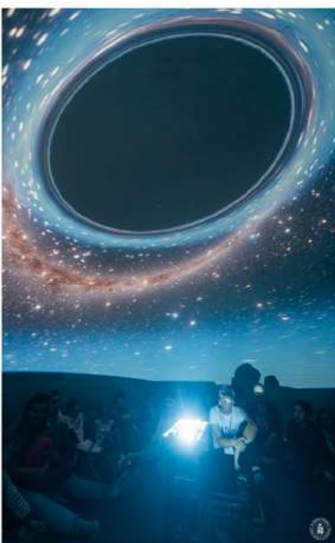
NIEBO DO WYNAJĘCIA- MOBILNE PLANETARIUM

Zgodnie z zapowiedzią prezentujemy fotograficzny przegląd atrakcji, jakie czekały na naszych gości w tegorocznej edycji Nocy Naukowców. Już teraz zapraszamy na kolejne spotkanie – jak zwykle pełne niespodzianek i niezapomnianych wrażeń.