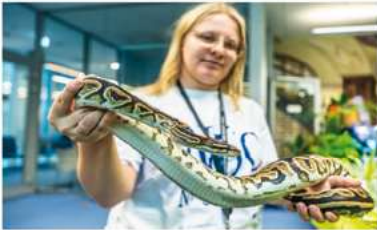
Z TROPIKÓW DO BIBLIOTEKI