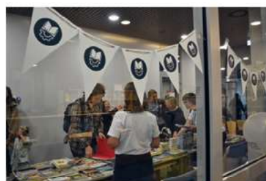
LITERACKA WYMIANA: KSIĄŻKA ZA KSIĄŻKĘ